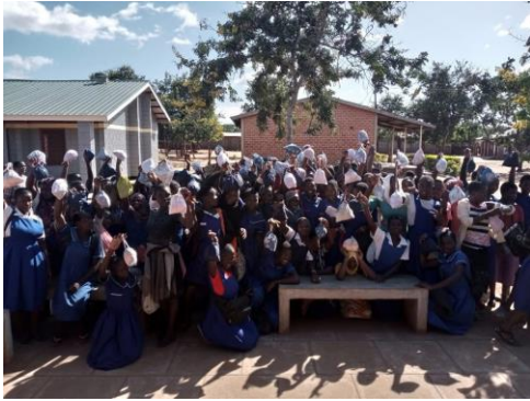
Girls at Kabwiri Secondary School Singing Songs after Receiving Sanitary Kits

Girls find that pants are in short supply due to cost so the provision of these in the kits is important to them being able to use the kits. 620 knickers (3 sizes) were brought in March 2022 as shown in the following chart.