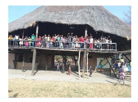
Takumana Children's Club after their activities in their church