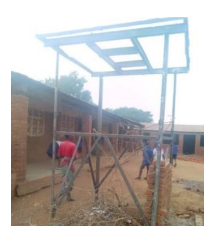
Construction of the water tower.

Starfish in conjunction with Chisiyo's link school St Josephs' Thame, have now provided a link up with the local water authority to bring piped water to the school which will then fill up large water tanks installed on top of a tower, from which there will be a number of taps for drinking from and hand washing.