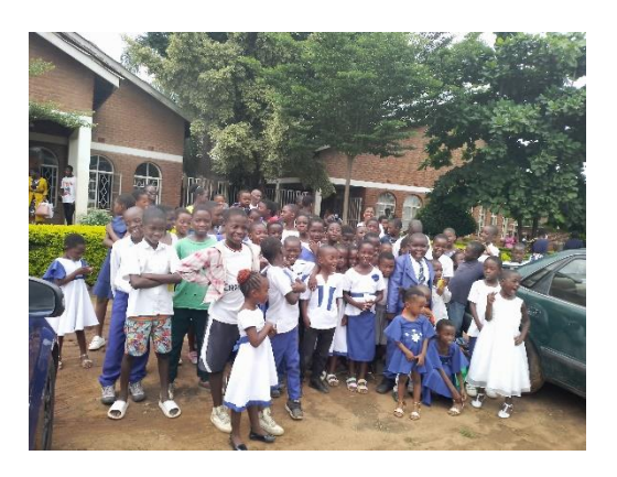
Children's club visit to Kuti Game Reserve.