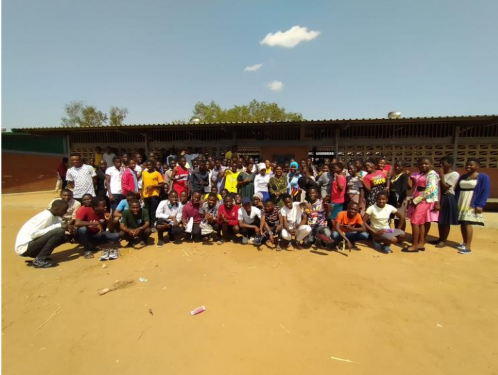
Students at the annual students' meeting

During the meeting, students were given shoes, clothes, pens, notebooks, soaps, toothpaste and other things. The best-performing students were given presents for their hard work.