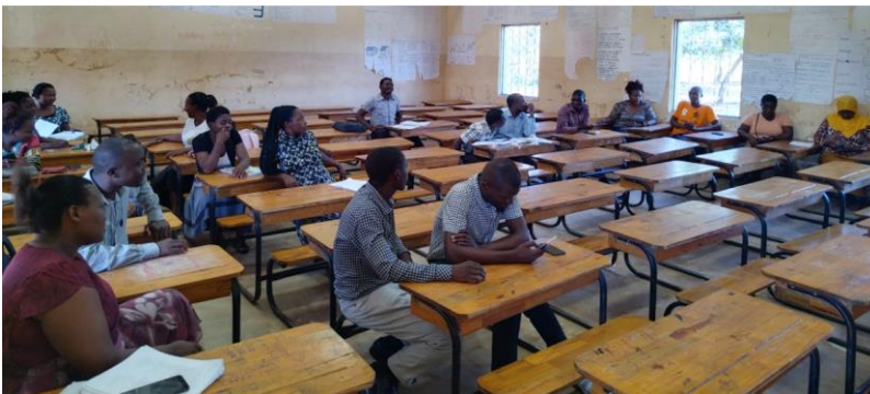
Inter-school session in progress for Mikute and Demera school

Attendance at Demera has increased from 12 to 20 teachers, Mikute from 15 to 25, Lifuwu has 10 and Maganga, which had problems re-organising after the pandemic then flooding etc last year has started this term on a high with 20 teachers attending. Teachers meet for fortnightly sessions within their own schools. Demera and Mikute Literacy Leaders proposed an arrangement for exchange visits where at times sessions should be done at one school jointly. Demera teachers have so far visited Mikute twice and vice versa.